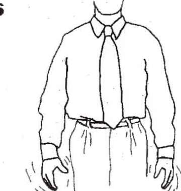
10 sec shake hands p. 68