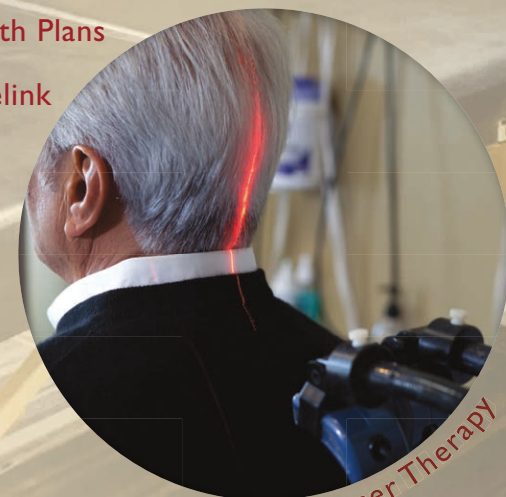
Infrared Laser Therapy

“THE DOCTOR OF THE FUTURE WILL GIVE NO MEDICINE, BUT WILL INTEREST HIS PATIENTS IN THE CARE OF THE HUMAN FRAME, IN A PROPER DIET, AND IN THE CAUSE AND PREVENTION OF DISEASE.” THOMAS A. EDISON