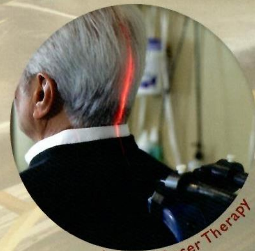
Infrared Laser Therapy

“THE DOCTOR OF THE FUTURE WILL GIVE NO MEDICINE, BUT WILL INTEREST HIS PATIENTS IN THE CARE OF THE HUMAN FRAME, IN A PROPER DIET, AND IN THE CAUSE AND PREVENTION OF DISEASE.” THOMAS A. EDISON